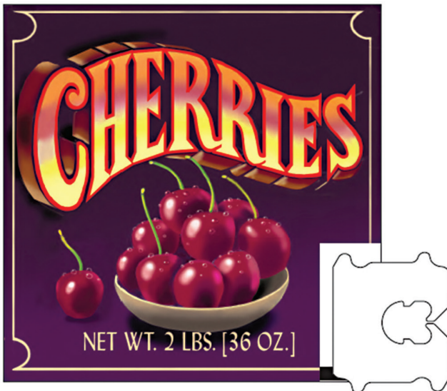
Front of Label - Faces away from package, towards consumer.

After the labels are printed they can be applied by hand or run through a Kwik Lok automatic or semiautomatic bag closing machine.