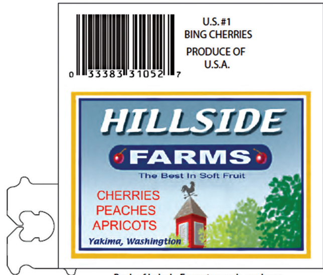
Back of Label - Faces towards package.